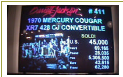
428 CJ Engine Cars Led The Pack r